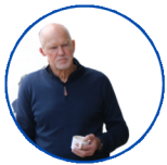
George PAPANDREOU

However, an emerging "reformist culture" inspired by Enlightenment ideals and liberalism seeks to challenge clientelism and promote responsible citizenship.